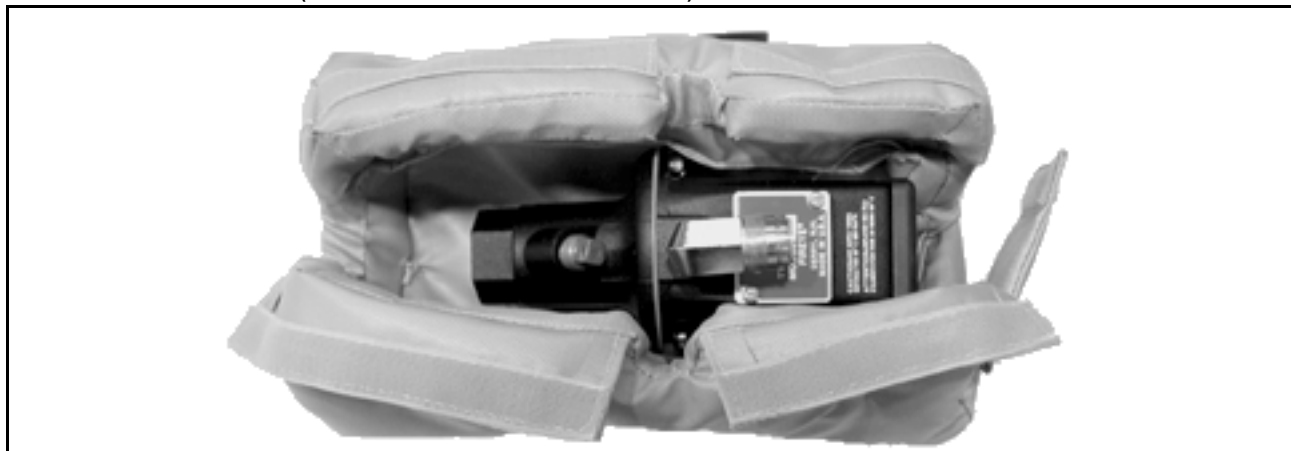
FIGURE 1. 97-1047 (SHOWN WITH 45FS1 FLAME SCANNER)

The flexible quilted jacket wraps around the scanner and is secured with hoop & loop seam fasteners. Holes are provided for scanner cable entry, 1" sight-pipe entry, and vortex-tube cooling air entry. A flap on the rear of the jacket allows access to view the back of the scanners where required.